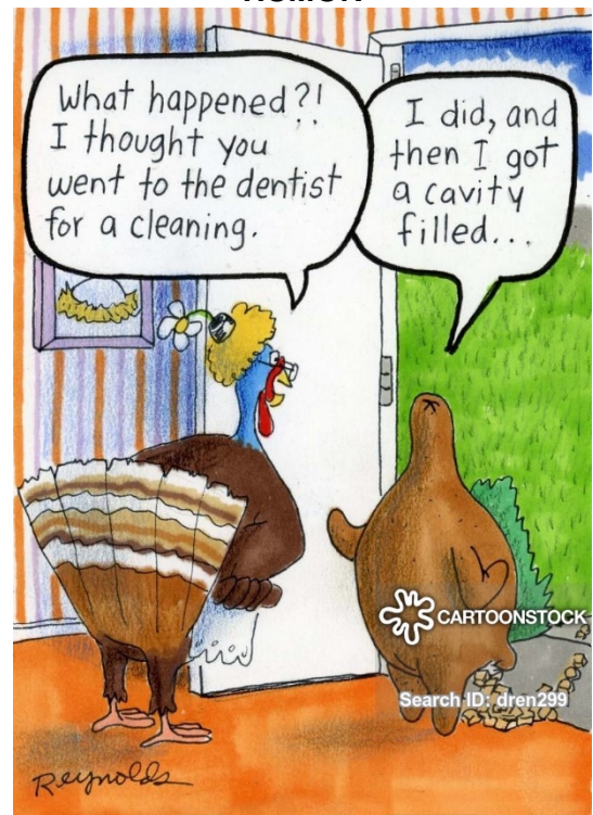
Happy Thanksgiving, Everyone!